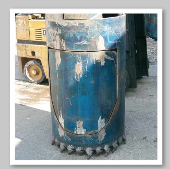
Clam-Core & Coring Buckets