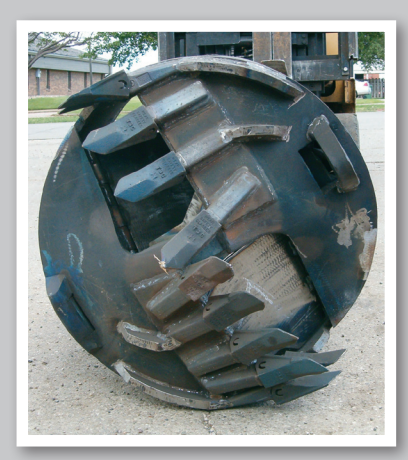
Various types of teeth