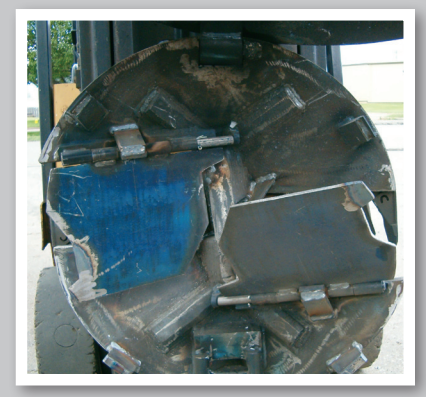
Choice of steel or rubber sand flaps