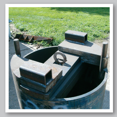
Heavy duty lock & release for the clam core doors