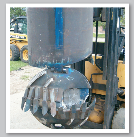
Drop Bottom Buckets

Gus Pech Mfg. Co., Inc. builds a complete line of drilling buckets and tooling for your drilling operations. We manufacture drop bottom buckets, coring, clam-core, plunger style, belling and water bailers.