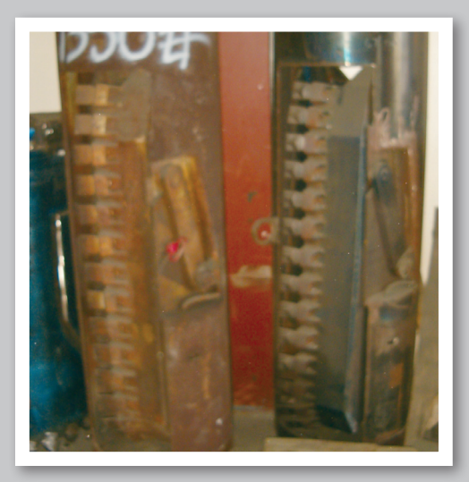
Belling Style Bucket